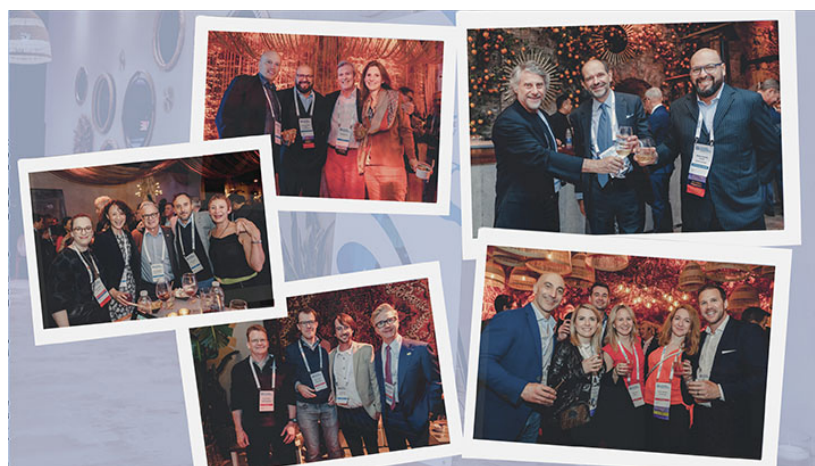
Networking at the 2023 LES Montréal Conference.