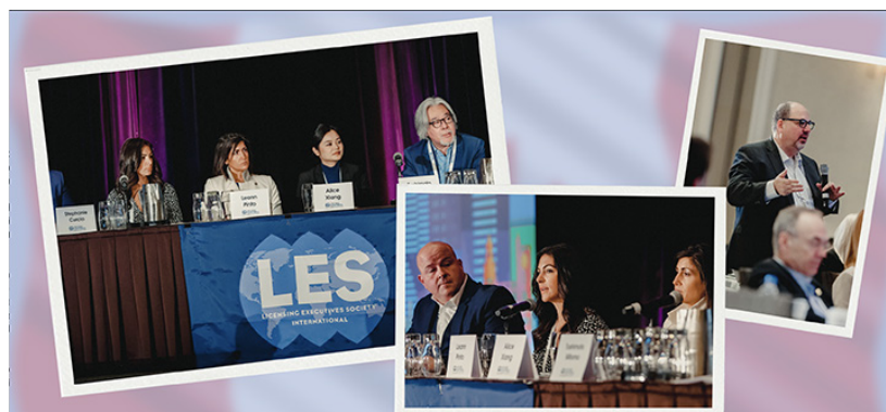
PANEL DISCUSSION ON ARTIFICIAL INTELLIGENCE