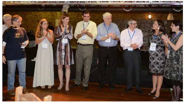
LES Brazil members and staff for the LESI Annual Conference in Rio.

In addition, and arising out of a proposition made during the IMDM in Rio by LES Italy, we are pushing to look into the economics and feasibility of an experiment with the epublishing of les Nouvelles. More on this proposition can be found in the minutes of the IMDM. This exciting development could revolutionize the delivery of the content of les Nouvelles and provide considerable savings.