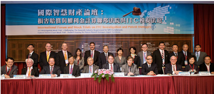
International Forum at Taipei.

I then travelled to Hangzhou, ‘the paradise on earth’, where LES China hosted the 4th Asia Pacific Regional Conference . This meeting was a wonderful collaborative work of not just the AP region but across all other continents. Combining an excellent intellectual program with a social program for participants to experience the beauty of