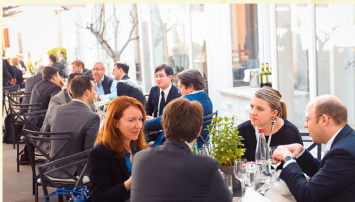
Young Members Networking.