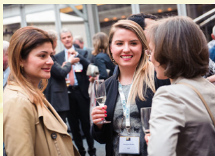
Networking at the Welcome Reception.