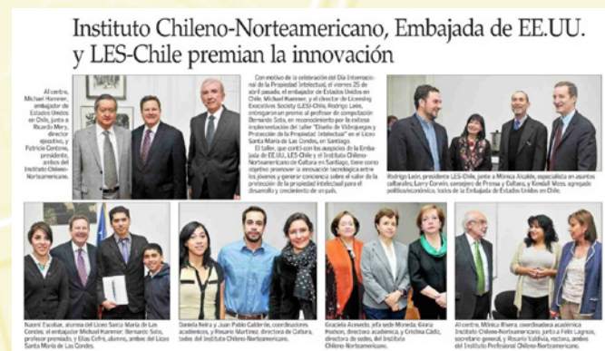
Newspaper Clip: "El Mercurio" April 5, 2015.