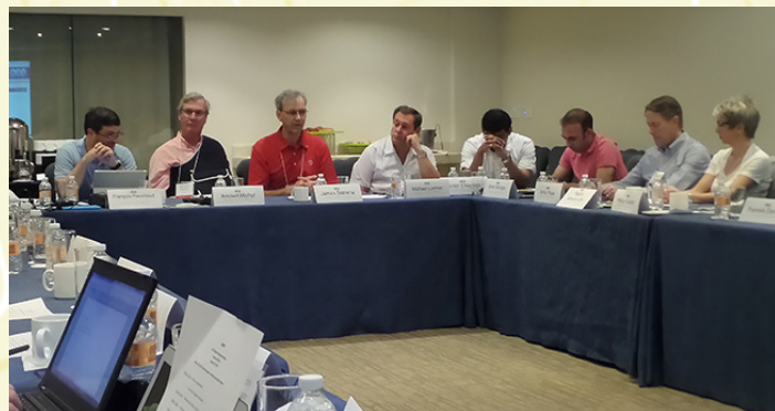
LESI International Board, Past-Presidents, National Presidents and Committee Chairs meet in Cancun.

Many thanks to all of those who took time from their personal and business calendars to attend the Winter Planning Meeting. They all made important contributions to LESI.