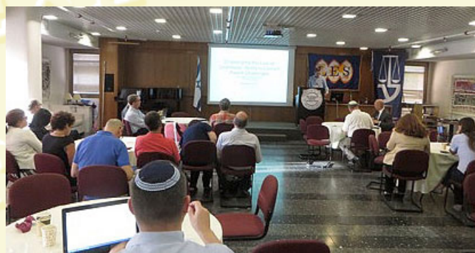
Audience at seminar.