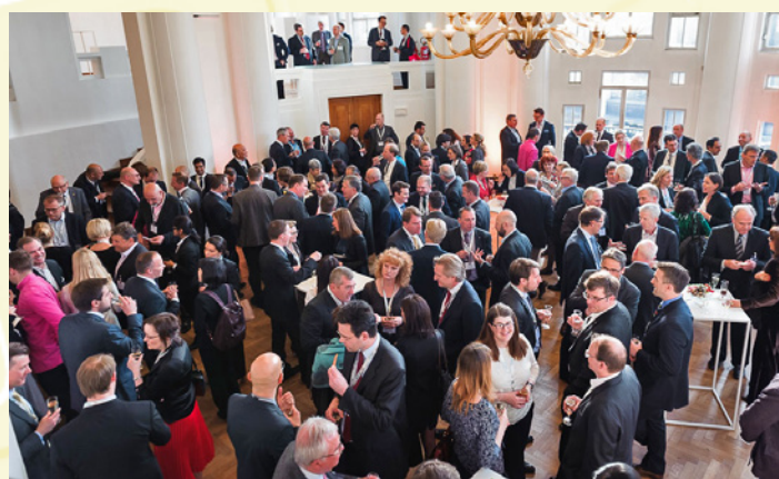
Networking before the Bozar dinner.