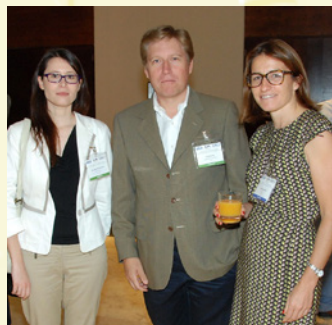
Attendees at the joint conference.

Officers from the Peruvian Trademark Office, the Peruvian Patent Office and the Peruvian National Agency of Science and Technology commented about their experiences on the conference topic.