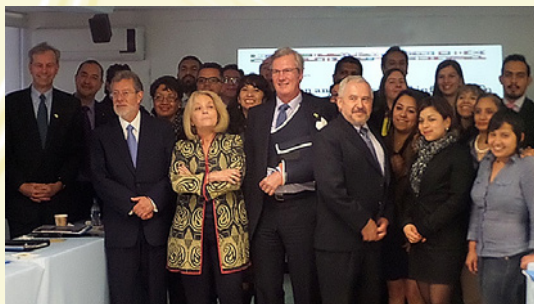
LES Mexico in January 2015.