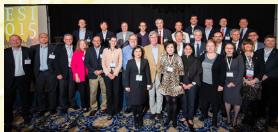
LES Society Presidents and LESI Board Members welcome LES Thailand to the family.