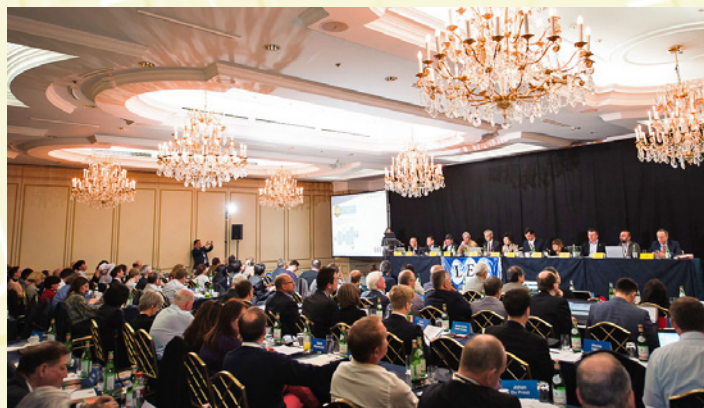
LESI Board and Delegates at IMDM.