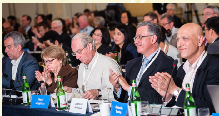
International Management & Delegates Meeting.