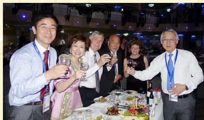
LES International leaders celebrate at the conference in Moscow.