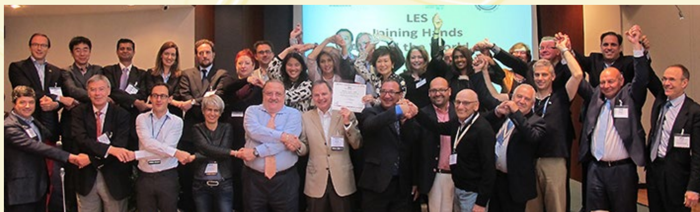
Joining Hands – a stronger LES Family and closer: participants gather in Moscow.