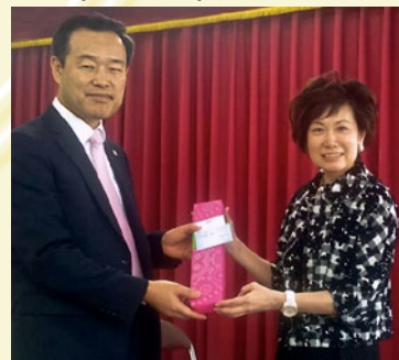
Meeting with Commissioner Kim Young-min of Korea IP Office.

As IP and technological transfer play an increasingly important role around the globe, I am pleased to give presentations in Hong Kong, Geneva, London and Singapore on recent IP trends particularly in the Asia Pacific.