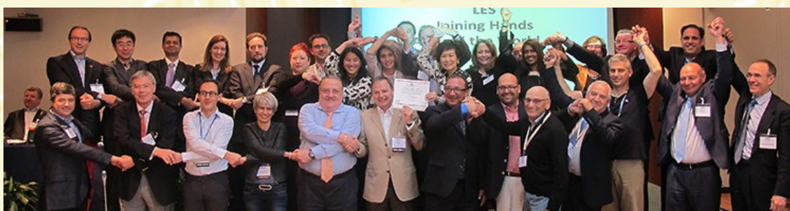
Joining Hands – a stronger LES Family and closer: participants gather in Moscow.