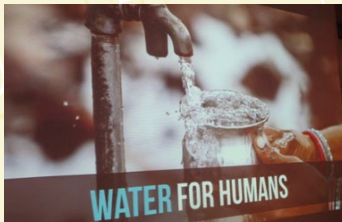
A slide from the presentation of GTIF 2014 Award Winner, Water for Humans.