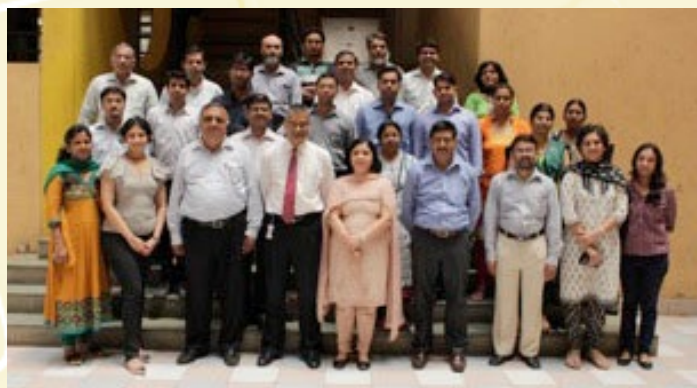
LES India members at its Around the World/World IP Day event.

In addition to the above, the LES India Society has spent much time and effort to redesign and improve its website: http://lesindia.org/ .