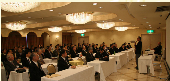
LES Japan hosts an educational seminar.

Eight monthly trustees meetings (in Tokyo and Osaka) were held to manage our activities. LES Japan is providing a wonderful learning opportunity and significant enhancement of professional networks through various programs. In 2009, 21 monthly educational programs (12 in Tokyo and 9 in Osaka) provided license and IP related lectures to approximately 980 people. Four kinds of licensing courses (Basic License Course, Practical License Course and License Agreement in English Course (Basic and Practical)) provided trainings to approximately 200 participants. In addition, 14 working group were active and held study meetings. We have actively responded to recruitment of public opinion on 1) the reexamination of criminal measures against trade secret issues drafted by the Ministry of Economy, Trade and Industry (METI), and on 2) the provisional rules for formulating and amending national standard involving patent drafted by Standardization Administration of the People's Republic of China.