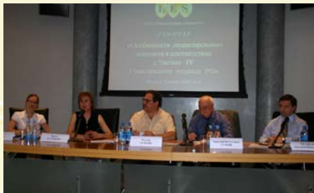
Seminar held by LES Russia in Moscow on June 5, 2008.

On June 14 in Moscow, LES Russia held a seminar "Companies' Strategies and Practices in IP Managing and Technology Licensing." 27 attendees from Russian and Ukrainian industrial companies and legal circles participated in the seminar. The main goal was to share experiences