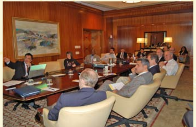
Chicago Meeting Workshop presents Life Sciences Licensing in the Middle East and Africa.

During 2007, the committee organized programs and arranged speakers for the 2007 LESI meetings in Zurich and Vancouver, and began to organize programs and arrange speakers for the 2008 meetings in Chicago and Orlando. In addition, the committee began to build on the Special Americas Program it presented in 2006 that brought Latin American industry representatives north to meet with North American industry representatives in New York. The committee worked with the leaders of the LES societies in Argentina, Brazil, Chile, and (USA & Canada) to plan a week-long sequence of conferences in Brazil, Argentina and Chile centering on the experiences of industry and university speakers from North America. The committee also helped arrange speakers for the LES Mexico and Andean Community meetings and to collect and circulate information on local programs by the national LES societies in the Americas.