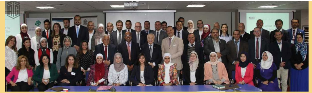
IP workshop participants from the law and pharmaceutical sectors.

Module 4: Legal actions applied on Trademarks.