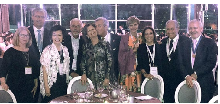
LES Past-Presidents and guests at the gala dinner.

- "instead of thinking about what could be, we tend to think about what is."