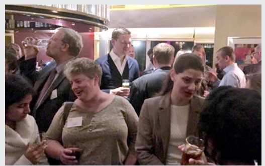
Photo highlights from past LES Benelux Licensing Courses. This year the course will take place on November 13 and 14 in Leuven, Belgium.

Up-to-date information can be found on the website of LES Benelux: www. les-benelux.org. For more information about registration please contact secretariat@les-benelux.org.