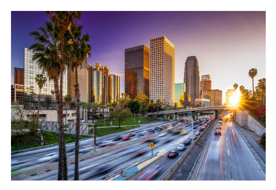
"Big Data to Smart Data: Use It or Lose It"

Hear from Experts - Learn & Network - Lunch & Reception