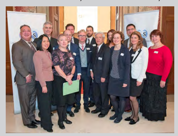
Group photo with many of the speakers.