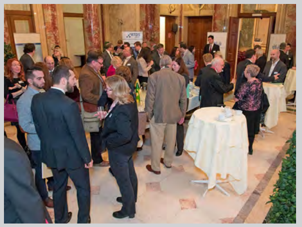
Welcome Coffee in the foyer of the House of Industry.

In addition to the Conference, the organizing team of LES Austria decided to arrange an aperitif at The Bank Brasserie & Bar of the Vienna Park Hyatt Hotel, followed by a ball evening at the traditional Vienna Coffee House Owner's Ball in the Imperial Hofburg Palace. Twenty-four participants of the Regional Conference and/or the Winter Planning Meeting attended and enjoyed the unique Viennese ball atmosphere—an unforgettable experience in particular for the attendants from overseas.