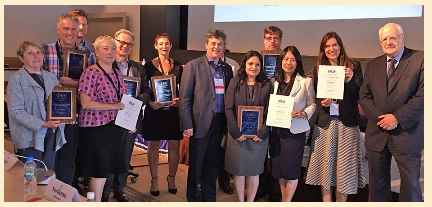
Presidential Awardees at the Annual Conference.