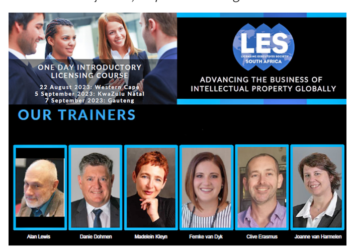
Trainers for LES SA course

LES South Africa will be presenting its LES100 one day introductory course this year in the Western Cape (August), Gauteng and KwaZulu Natal (September). Registration is now open on the LES SA Website: Courses—Licensing Executives Society NPC, https://licensing.co.za/courses/.