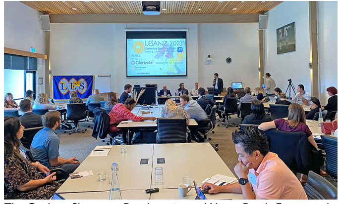
The Geelong Showcase Panel session at Waurn Ponds Estate at the 2023 Annual Conference in Geelong.

Throughout the conference, attendees engaged in a dynamic format of presentations and panel discussions, offering plenty of opportunities for questions and discussion. For instance, the Agri-tech session brought together experts from SproutX and Growave to discuss startups in the agricultural technology sector. Meanwhile, the Collaborating for Commercial Success session showcased Deakin