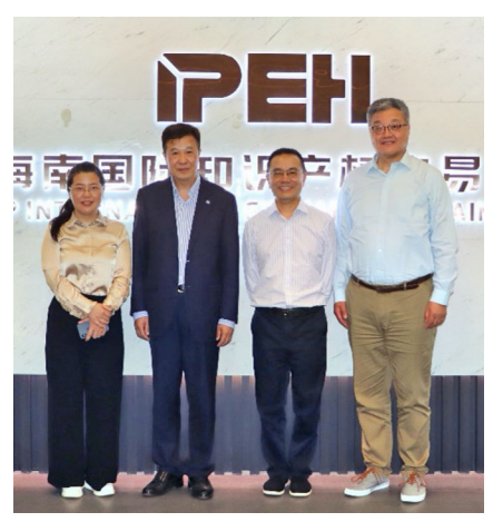
LES China and IP International Exchange of Hainan (IPEH)

During the meeting on April 13, 2023, LES China and IPEH discussed issues of mutual interest and the possibility of future cooperation. LES China invited IPEH and its