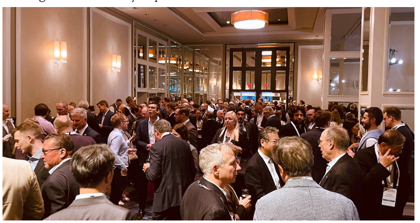
Networking at the 2023 LES Montréal Conference.

Again, thank you for your membership in LESI. I am proud to serve as your president for the coming year. You are part of a great organization so please make use of the resources it provides you. If you are interested, volunteer. I can assure you that you will get more out of being involved in this organization than you put in.