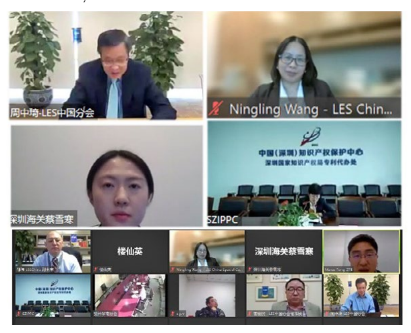
LES China Annual Meeting speakers and some of the participants.

LES China hopes that the COVID-19 pandemic will be put under control and business and daily life are back to normal in 2022 and the LES members and friends may meet in person at the LESI 2022 Annual Conference in Venice, Italy to be held May 8-10.