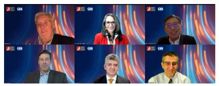
Speakers at the build-to-sell forum.