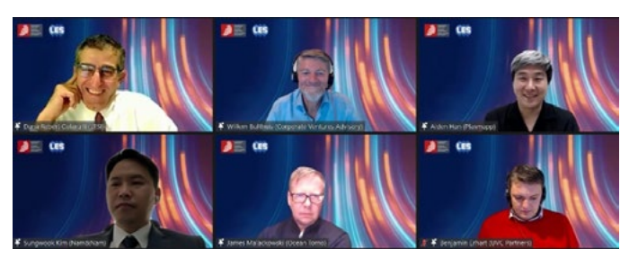
Speakers at the growth-financing forum in South Korea.