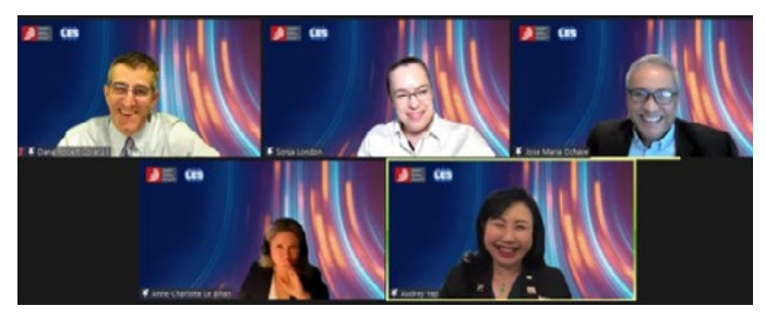
Speakers at the licensing forum in the Philippines.

We would like to take the opportunity to wish everyone a Happy New Year 2022! LESI, Let's Innovate! ■